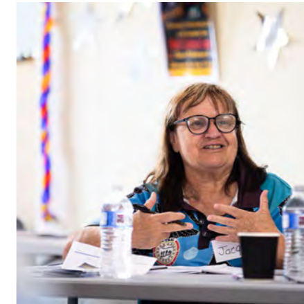
DV-alert First Nations (RA3-5)