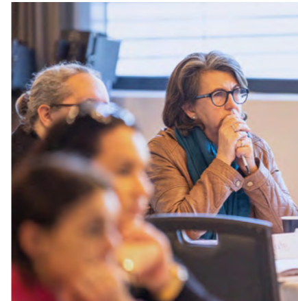
DV-alert Assessment Pathway

DV-alert has flexible learning options to support frontline workers who encounter people who are experiencing, or at risk of, domestic and family violence. To obtain the nationally recognised unit of competency CHCDFV001 Recognise and respond appropriately to domestic and family violence, there is a DV-alert learning pathway to suit you, with the following course options available: